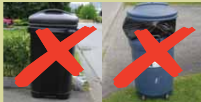
Container exceeds 121 litres